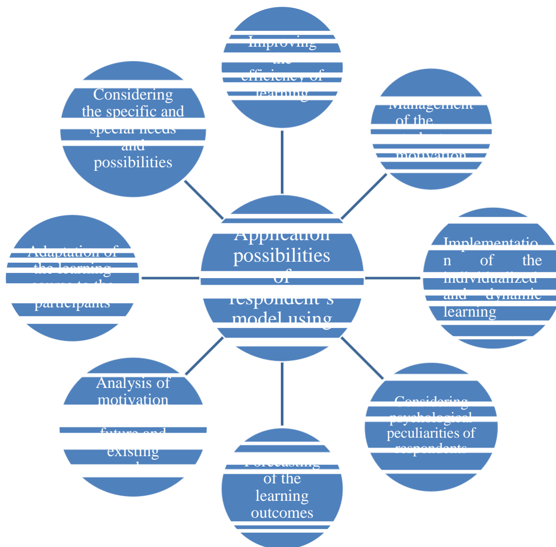
Fig. 1. Some application possibilities of a respondent`s model using in the distance learning courses

The next step for the effective development of appropriate a respondent`s models in distance learning courses is browsing of the psychological specific and based on criteria of existing approaches to the respondent`s model of distance learning courses.